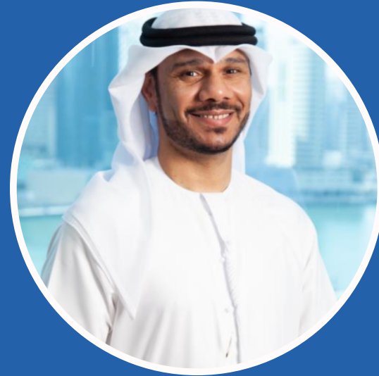
Mohamed Al Sabah