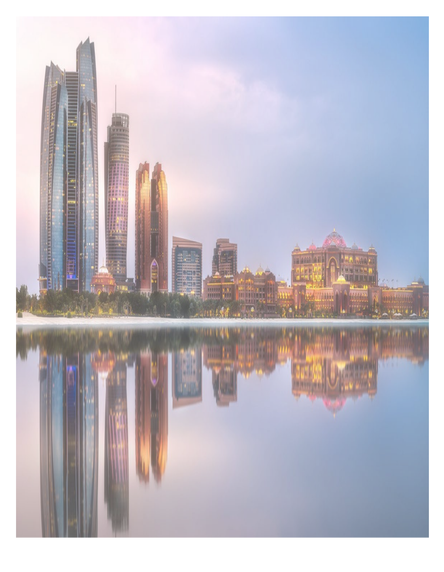
Our Practice Areas